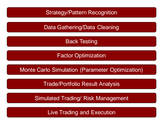
Fig: Steps involved in an end to end backtested strategy

In the figure below I illustrate all the steps which are usually taken while doing a thorough back-testing of a strategy.